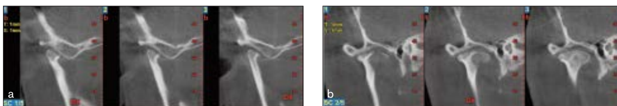
Fig 2 CBCT images of a TMJ of a patient without a RDC/TMD diagnosis but with bony osteoarthritic changes (erosions and osteophyte). (a) Sagittal. (b) Coronal.