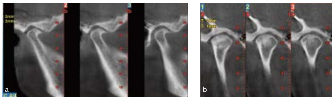
Fig 3 CBCT images of a TMJ of a patient with a RDC/TMD diagnosis of osteoarthritis and with osteoarthritic changes (erosions and osteophyte). (a) Sagittal. (b) Coronal.